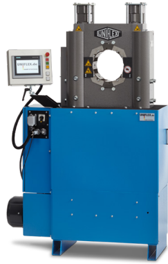
HM 375 | HM 380 H