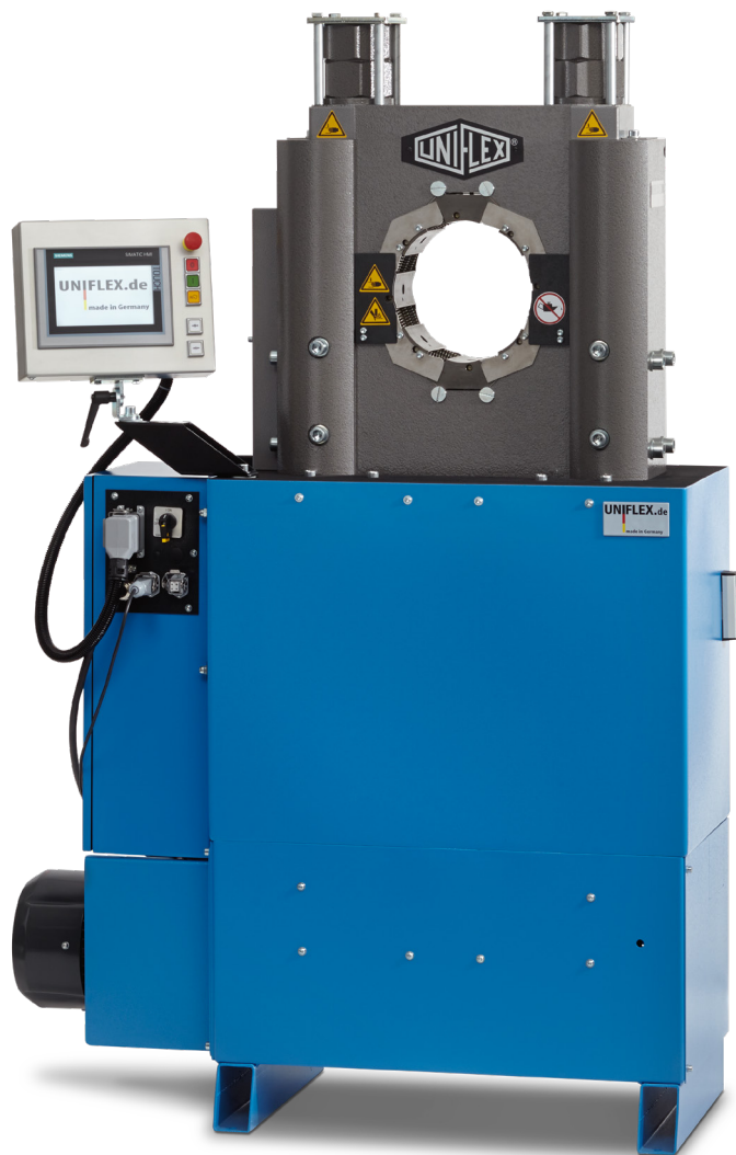
HM 375 | HM 380 H

As reliable classic machines, the HM 3xx/HM 400 series unites all the outstanding properties of a production crimper. They are compact, powerful and make ergonomic working possible. Combining a convincingly solid construction with a high level of user friendliness, and long service life, the HM 3xx/HM 400 series sets a new standard for quality and cost effectiveness.