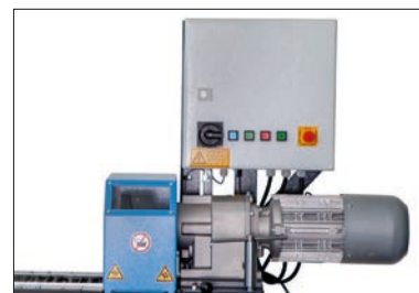
Security Cover (UNT 6)