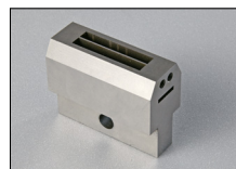
508.1002.3 (26 types, 13 each row)