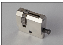
508.1003.3 (10 types in one row) 508.1001.3 (17 types distributed on 2 rows)