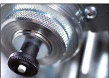
504.003 Additional type holder for UP 10 Ecoline. Simple change between different markings. 25 types.