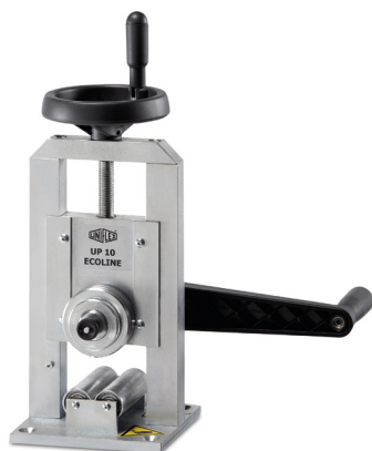
UP 10 Ecoline