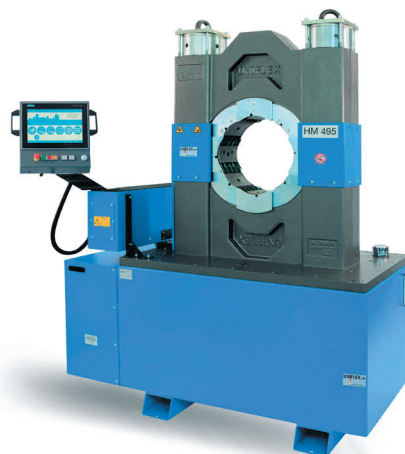
HM 495 IPC