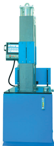
HM 465 IPC (side view)