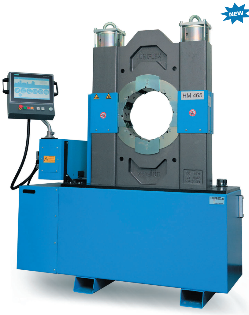
HM 465 IPC

With its innovative design, specifically developed for special industrial sizes, and an impressive press force of 4000 to 6000 kN, this series sets new standards for quality and efficiency. Complemented by classic features such as user-friendliness and durability, the HM 465 and HM 495 deliver productivity and effectiveness in a compact footprint.