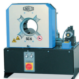
SC 6 Ecoline