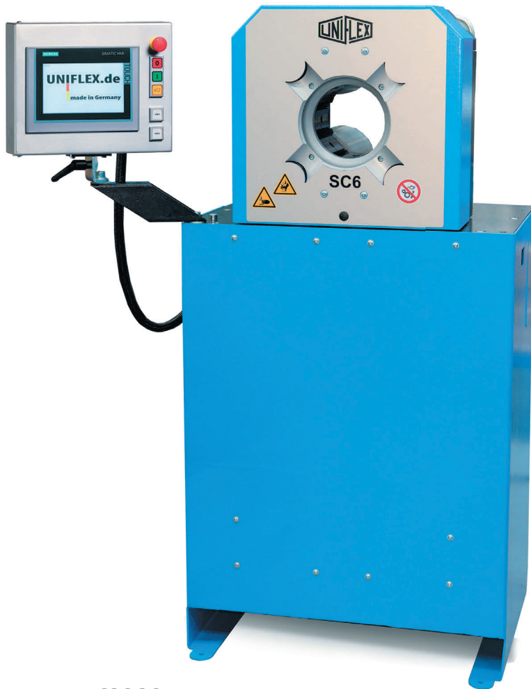
SC 6 C.2

With its slim, innovative design, high user-friendliness, versatility and long service life, the SC 6 series with its 4-cylinder technology sets standards for quality and economy. Its very compact design, despite the large opening travel, allows ergonomic working. The long base jaws enable the SC 6 to crimp short 90° fittings up to 2" 4 SP, and the SC 6 S up to 2" R 15. The proven greaseless slide bearing technology reduces maintenance costs, extends service life and increases accuracy. Because the 4-cylinder technology is particularly resistant to contamination from press scale, UNIFLEX offers a 3-year warranty for the SC 6 and SC 6 S series.