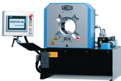
SC 6 Ecoline C.2