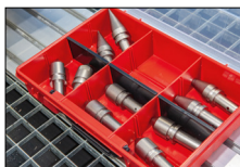
Sealing tips for hand clamping.