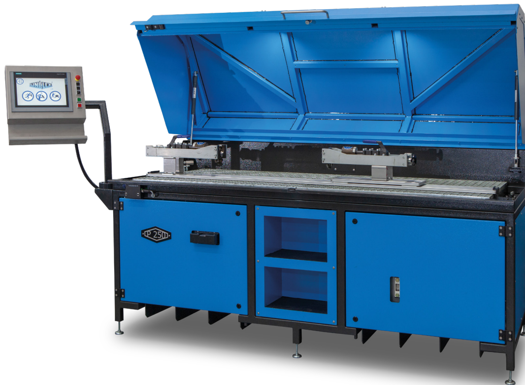
P 250 with one hand clamping

The P 250 / P 260 Test Bench with Control IPC are new modular test benches that can be adapted to your needs. They offer the possibility to test with the Steck-o, Hand or Hydraulic quick cone system. You can also install a Euro Pallet inside for the P 250 / P 260. The Chamber also accepts a non-end extension if you prefer to test a hose lengthwise (only P 250). The controller offers all parameters for a fully automatic test, with visualization of the pressure and may other features but also connectivity to your server or other machine in line with industry 4.0. or IoT.