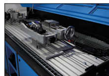
Extension of quick system to 2 lines.