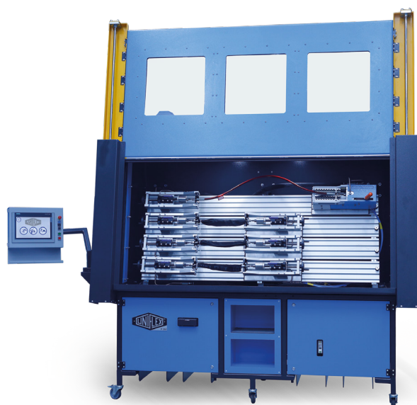
P 260 with four hand clampings