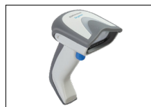
Barcode Scanner BCR CTR2C-Kit