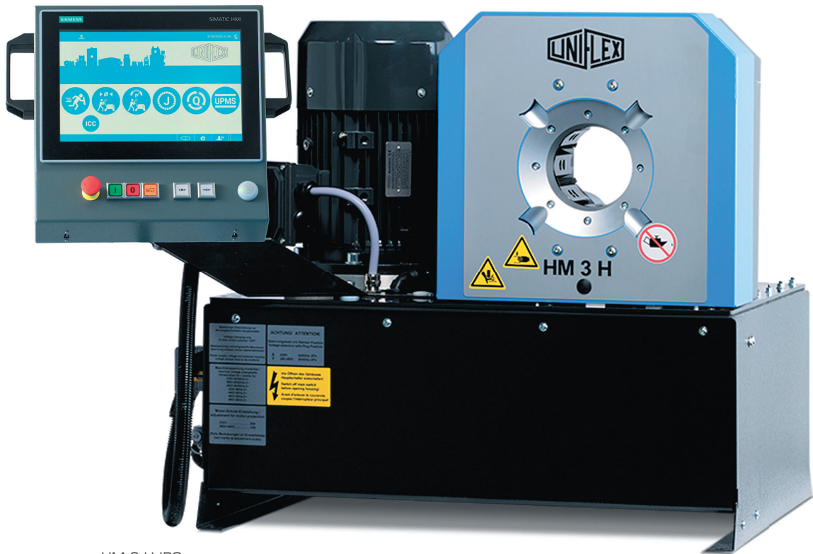
HM 3 H IPC

Due to its narrow and innovative construction, high level of user friendliness, and long service life, the HM 3 H sets new standards for quality and cost effectiveness. With its compact construction, it allows easy, uncomplicated, and rapid crimping. The intuitive UNIFLEX Software on the convenient IPC completes the HM 3 H and ensures product quality.