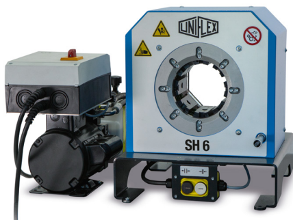
SH 6 Mobileline