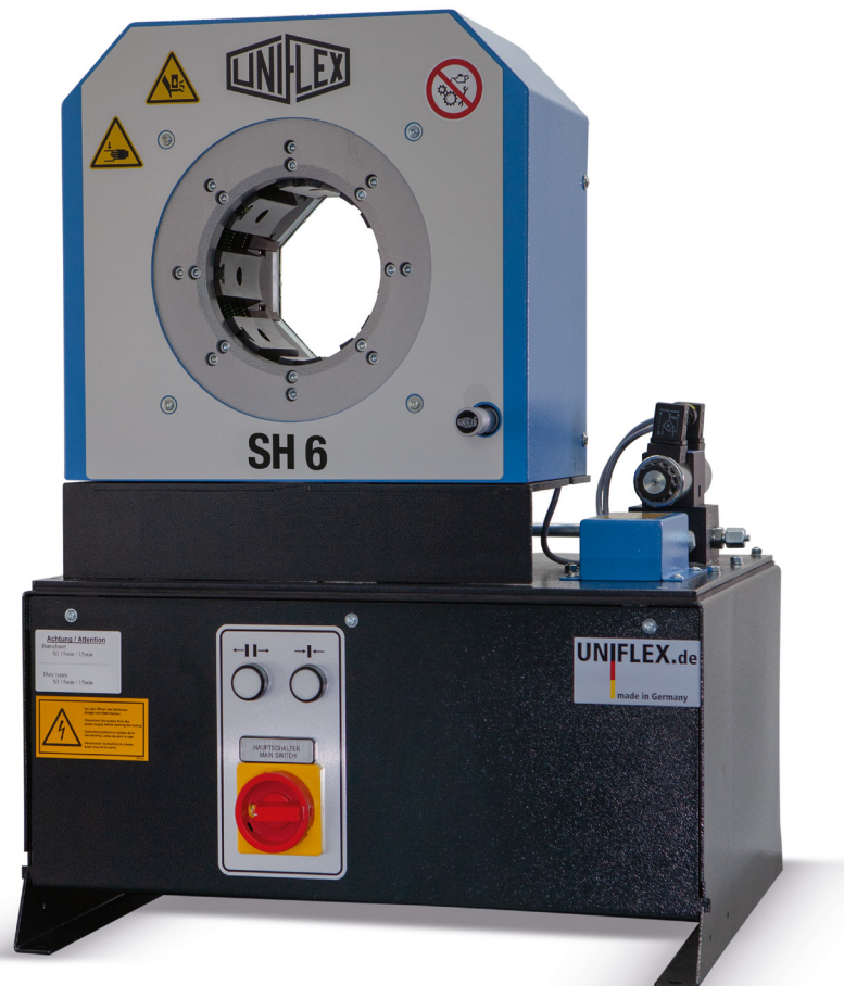
SH 6 Ecoline

The use of long master dies allows you to crimp 90° elbow fittings up to 2" with the tried and tested greaseless slide bearing technology, which reduces maintenance costs and increases the product quality.