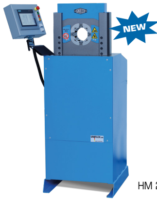
HM 222 C.2