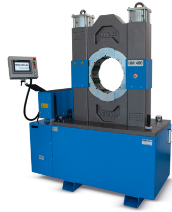
HM 480 | HM 495