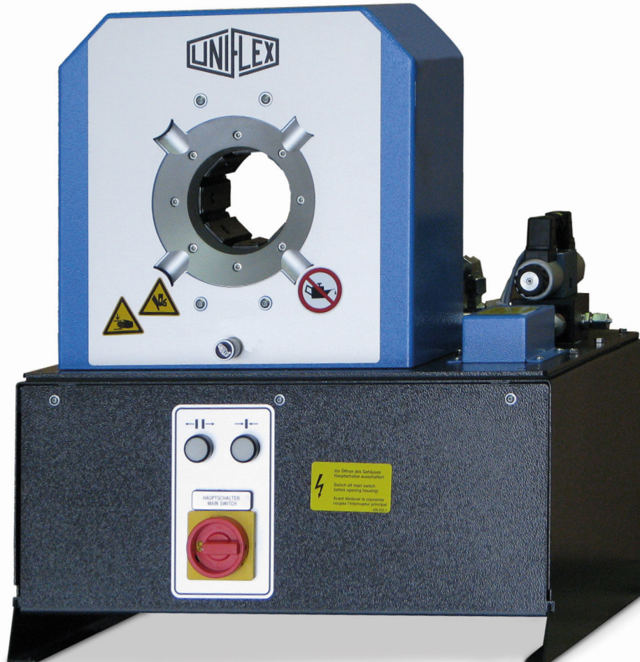
SC 3 Ecoline

Because the 4-cylinder technology keeps press waste away from the die, UNIFLEX offers a 3-year warranty for the SC 3 and SC 4 series.