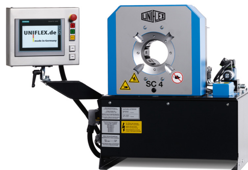
SC 4 C.2