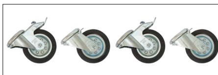
Roller kit 408.2