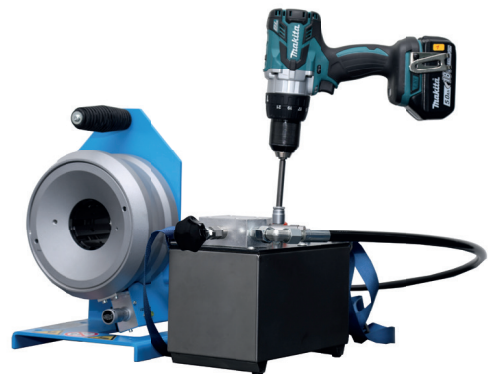
With S2 Ecoline and cordless screwdriver