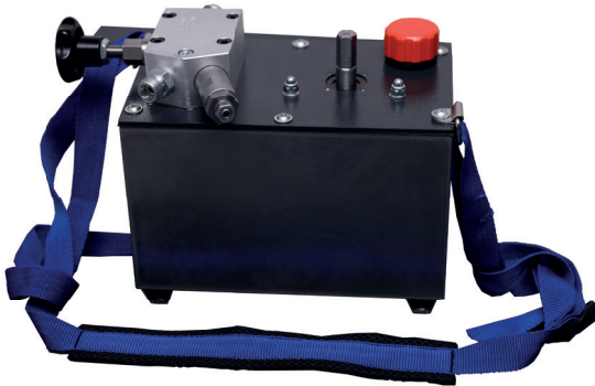
PUM 0.8/3.2-700 bar

Due to their high performance, robustness, and compact dimensions, UNIFLEX's mobile hydraulic crimpers are appreciated worldwide. With an innovative high-pressure unit, UNIFLEX now offers an ingeniously simple external drive. Using this easy-to-handle unit and an off-the-shelf screwdriver (drive torque: at least 25 NM), manually operated workshop crimpers for 1" hoses (4SH/R15) can be driven hydraulically.