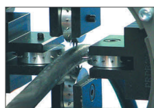
Constant prick depth