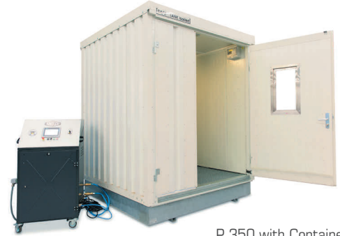
P 350 with Container