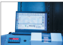
P 320 Laptop (UPP)