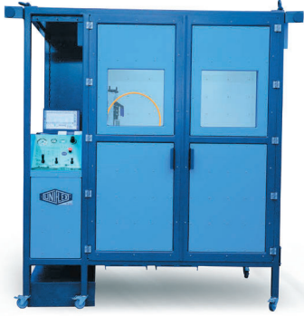
P 320 with UPP