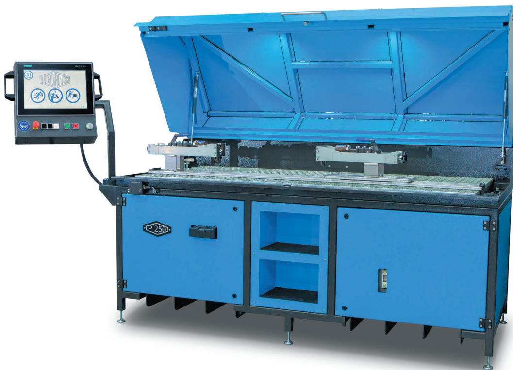
P 250 with one hand clamp line

The P 250 / P 260 Test Benches with Control IPC are new modular test benches that can be adapted to your needs. They offer the possibility to test with the Steck-o, Hand or Hydraulic quick cone system. Can fit a Euro Pallet inside for the P 250 / P 260. The Chamber also accepts a non-end extension if you prefer to test a hose lengthwise (only P 250). The controller offers all parameters for a fully automatic test, with visualization of the pressure and many other features including connectivity to your server or other machines in line with industry 4.0. or IoT.