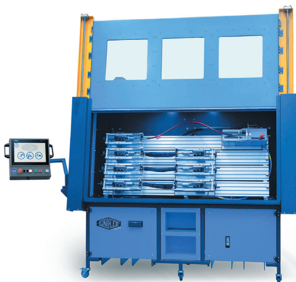
P 260 with four hand clamp lines