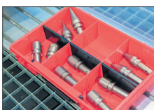
406.903 – Sealing tips for hand clamping.