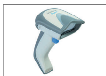
Barcode Scanner BCR Ctrl-BT