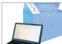
UPP Pressure Sensor for test benches available as an option. Laptop incl. software license included.