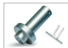
Steck-O Adapter-kit: 405.7