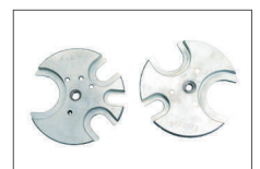
For Hand clamping system. 414.356 Hose retaining disc up to 1,500 bar. 414.366 Hose retaining disc up to 3,000 bar.