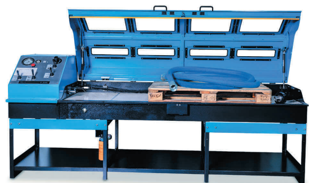
P 180 with pallets 1,200 x 800