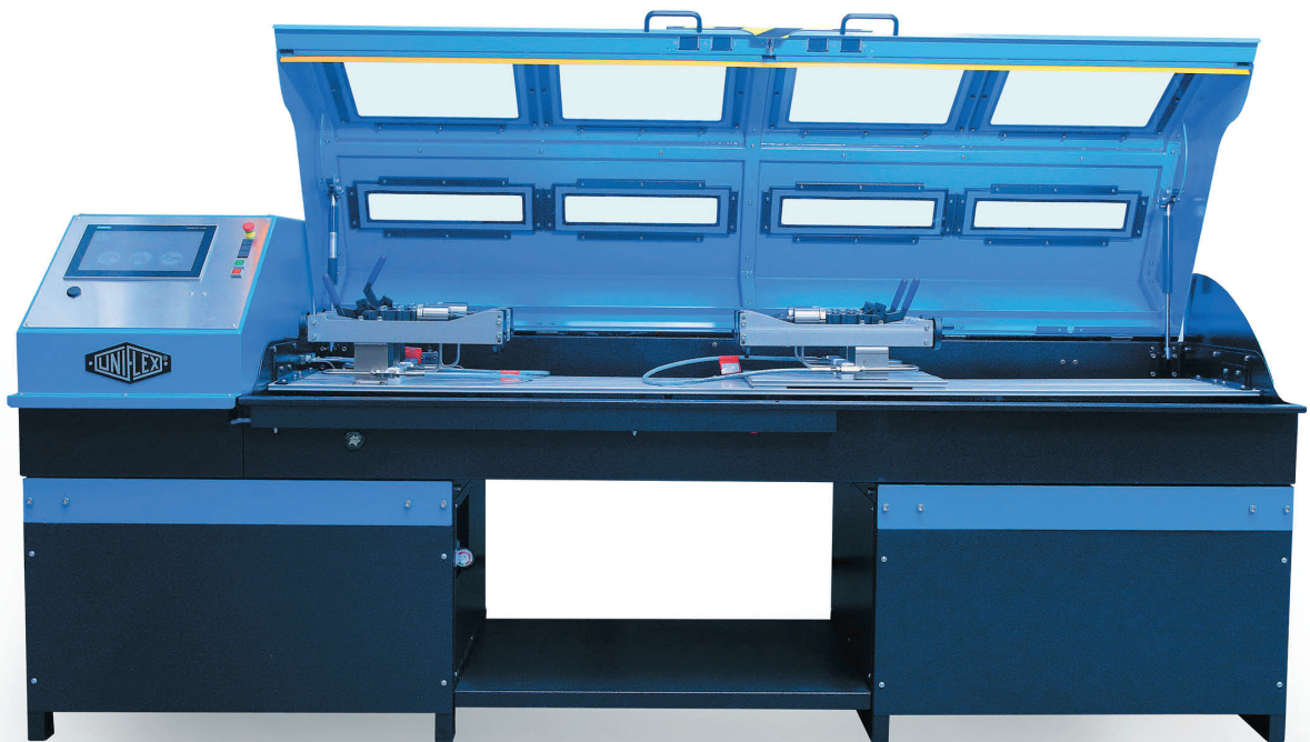
P 180 IPC + hand clamping

By testing the quality of your products, you opt for safety. The P 160 and P 180 workshop test benches allow for the efficient and safe final inspection and testing of hose lines. They are easy to operate and quickly become part of your routine procedures.