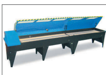
P 160 extension element 407.3150: total chamber length 3,600 mm (141.7") 407.3250: total chamber length 4,400 mm (173.22")