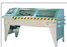
P 160 / P 180 are also available in stainless steel.